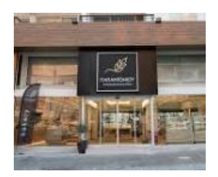
Bakery 4 km