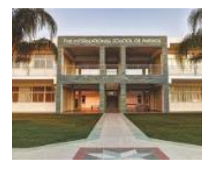
Private English School 6 km