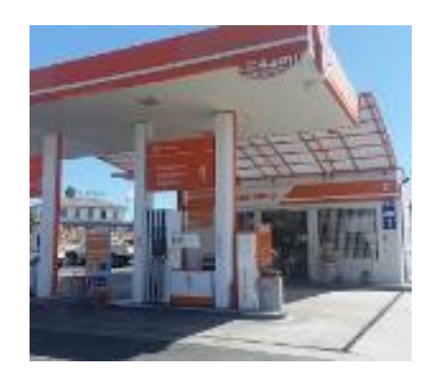
Petrol Station 4.4 km