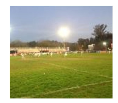
Sporting Centre 1 km