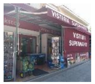
Mini market 500 m